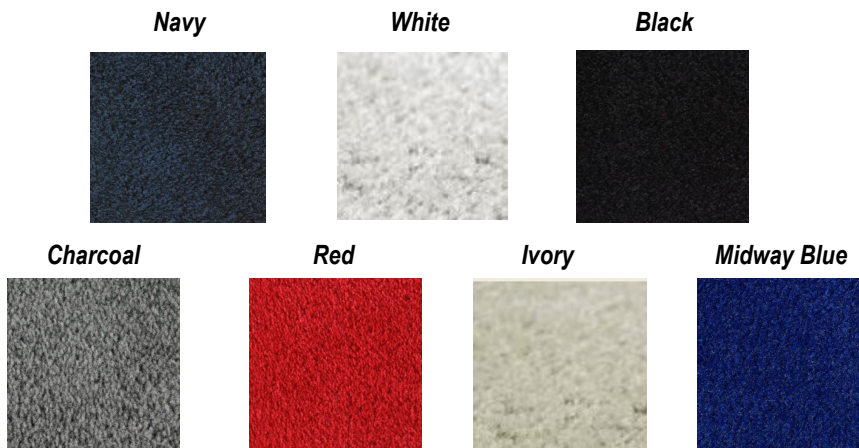
Table Skirt Colors