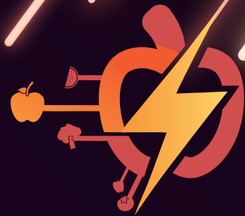
Exhibit Package Includes: